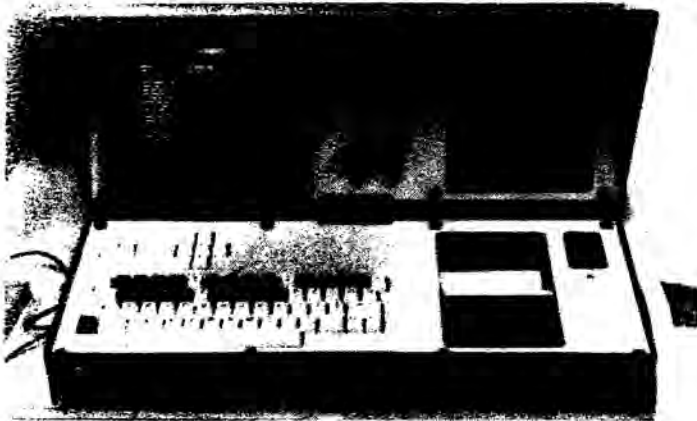
Figure 1 - Instrument

"Vital Force," a term used by both the homeopathic and acupuncture schools of thought in defining the total energy of the body, provides a common meeting ground for the practitioners of the east and west. Ultramolecular Medicine incorporates a knowledge of the total electromagnetic energy of the body and, through the new Society of Ultramolecular Medicine (S.U.M.), 6125 West Tropicana, Las Vegas, Nevada 89103, 702/367-0260, offers the clinician a means of understanding the various complex parts making up "Vital Force". Acupuncture and homeopathic physicians recognize the difficulty in capturing such energy for scientific research and analysis, but both have recognized the laws governing "Vital Force" based upon centuries of empirical observation and reproducible results. Indeed, allopathic medicine today recognizes the benefits of electromagnetic energy fields when applied in some circumstances, accelerating the healing of fractures, for example.