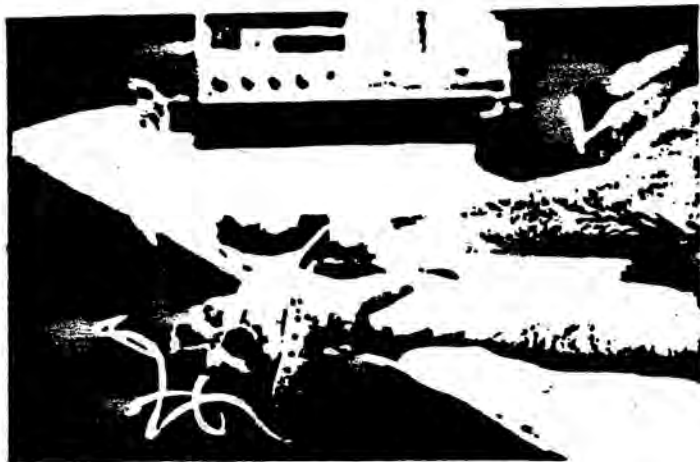
Figure 2. Quadrant reading, front foot.

Once the patient is attached to the Dermatron, a quadrant reading is taken. This measures a cumulative energy value flowing through one half of the body. Both front quadrants (overall energy value of all of the organ systems from the diaphragm up to the head) and hind quadrants (diaphragm through abdomen down to hind limbs) readings are taken. (See Figures 2 and 3.) The nor-